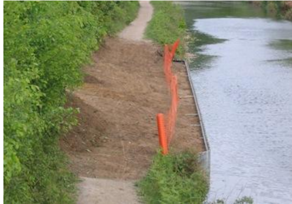
The nearly-completed 30m long permanent mooring built by Society volunteers at Runway's End, viewed from Eelmore bridge.

The regular SHCS working party meets every second and fourth weekend of the month (ie every two weeks mostly). The work parties exist to turn the money raised for the Canal (principally John Pinkerton trip boat income, but recently also some bequests) into tangible improvements along the navigation. Work has continued on the permanent mooring near the Runway's End near Farnborough during April and May and, as can be seen, is taking shape. It is hoped this will be completed by early June. (This landing stage is being provided primarily for John Pinkerton passengers who are visiting the Farnborough Air Show and has been part-funded from a grant from Rushmoor Borough Council.)