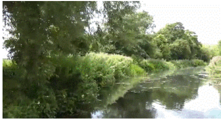
The off bank near the North Warnborough lift bridge before and after bank clearance by NWPG