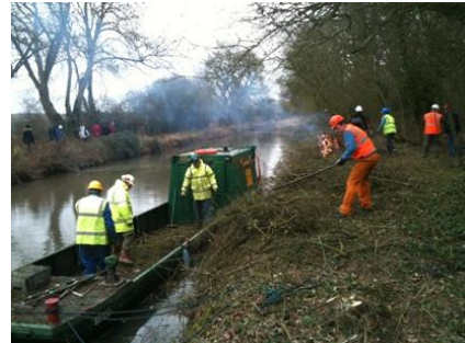
Members of KESCRG putting the Alan Flight to work at Lodge Farm bridge.

We should also point out that the Basingstoke Canal Authority rangers (who I am sure would not count themselves as volunteers) have also been hard at work with bank clearance near Broad Oak (a short distance east of Odiham). Those members of the John Pinkerton crew who have tangled with it will be pleased to know that the previously very narrow section between old bridge remains and overhanging trees has now been opened out (right). Almost unrecognisable now.