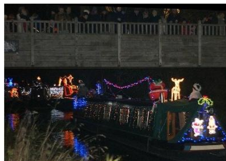
Leo II watched by onlookers at the Illuminated Procession at Woking