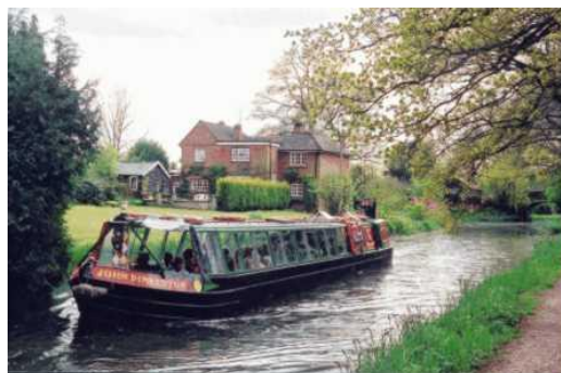
The Society's trip boat, the John Pinkerton

The John Pinkerton trip boat brings in the majority of the Society's income. The boat can accommodate up to 50 people and 2-3 hour trips run mostly from Odiham, crewed by volunteers. In 2009 nearly 200 trips took place and a record £27,000 was raised for the Canal. The profits pay for, among other things, plant and materials for structural repairs by the work parties. With this year's season now at an end, another profits record is being forecast.