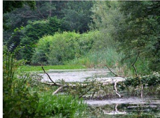
A section of the overgrown Brookwood pond.

If you would like to be involved with cleaning up the Canal at Brookwood, please email Kathryn at brookwood.cleanup@gmail.com