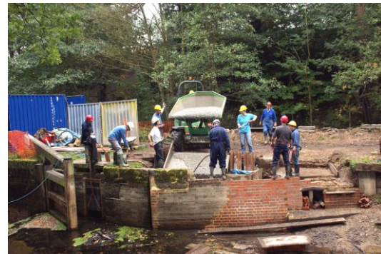
Repairs to the upper wing walls of Lock 17 under way by the SHCS working party

This lock, one of the Deepcut flight of 14 locks, was identified by the structural survey as being in need of significant renovation. We are indebted to the " Bit in the Middle " Waterways Recovery Group summer working party for having started this work. (They call themselves this because of the general geographical focus of the membership - the home counties mainly, but some come from far afield - Ed) . Completion of the upper wing wall rebuild and brickwork pointing and replacement in the lock chamber has now been taken over by the regular SHCS working party, operating as an unpaid contractor to the BCA. The expectation is to have the structural repairs finished during December ready for the replacement of the lower lock gates.