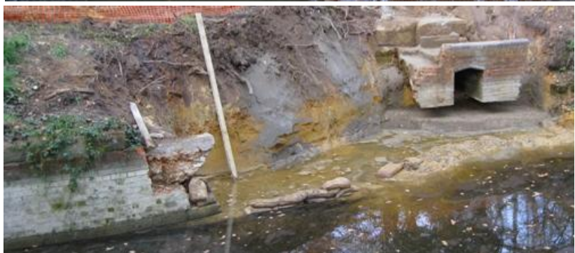
Lock 20 (lower right).