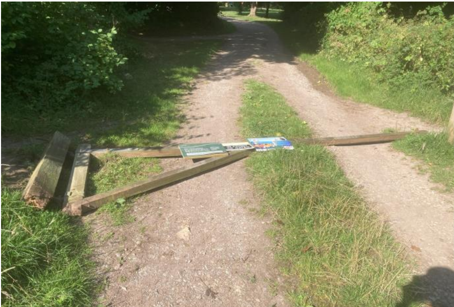
Colt Hill Wharf access before BCS Volunteers got to work

On the next weekend work party we were diverted to fit a new gate post for the access track to Colt Hill wharf. This had broken and also caused damage to the gate. This was all sorted and in addition, part of the access track was resurfaced.