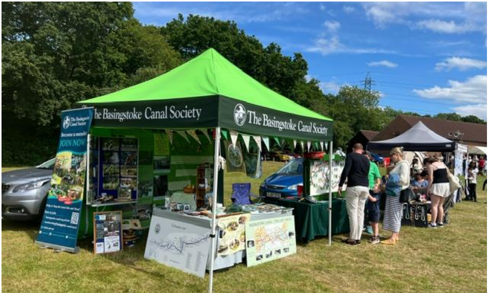
Above: BCS Gazebo at Zebon Copse Community Centre