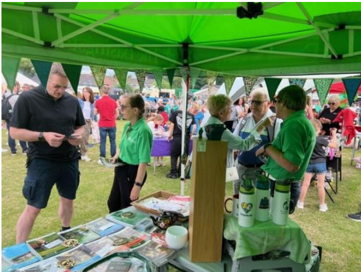
View from the Gazebo at Pyrford & Wisley Villages Flower Show.

We pitched both our gazebos and the Buzzer Box in our usual place by the fence as the vintage vehicles arrived. The clouds broke up and brought some sunshine as well as local visitors to this traditional country show. Our second gazebo was used to display a collection of green & white china and sales money was donated to the canal society.