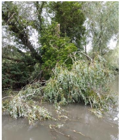
Topless tree before clearing

We received reports regarding a tree where the top had broken off and was hanging in the canal. The work boat was taken down the canal nearly to the Barley Mow and the tree cut back then twisted off high up and cleared.