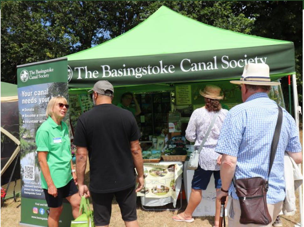
Above: BCS Events Team at Ash Village Fete, June 2024