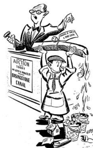
Right: Cartoon from Daily Mirror