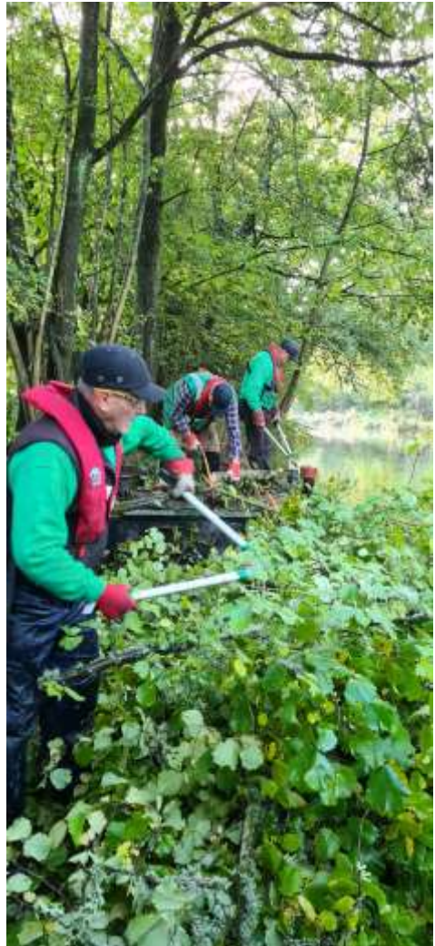
Volunteers working on sapling and undergrowth clearance along the canal.

We have been regularly seeing a dabchick (or little grebe as they are sometimes called) on the section of the canal between Lodge farm bridge and Swan Bridge. These have previously been on the canal above the Castle but this is the first year I have seen them in the navigable section.