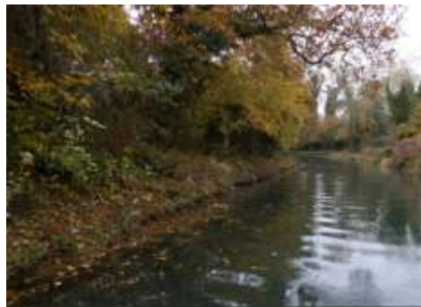
Before and after pictures of the off bank clearance from the North Warnborough lift bridge to the Castle