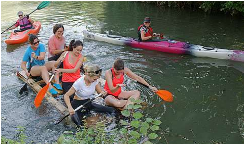
Competitors Fin and Tonic experience that sinking feeling, with safety crew on hand to assist.