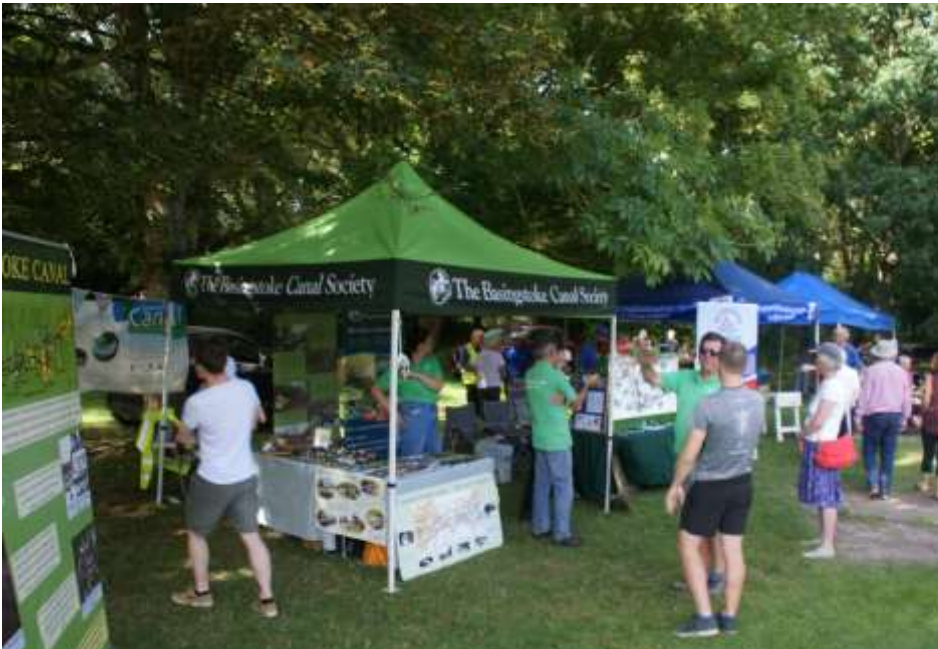
Above: our stand at the Odiham Raft Race. This year's event was held on a beautiful day and was a great success with lots of interest in the Society.