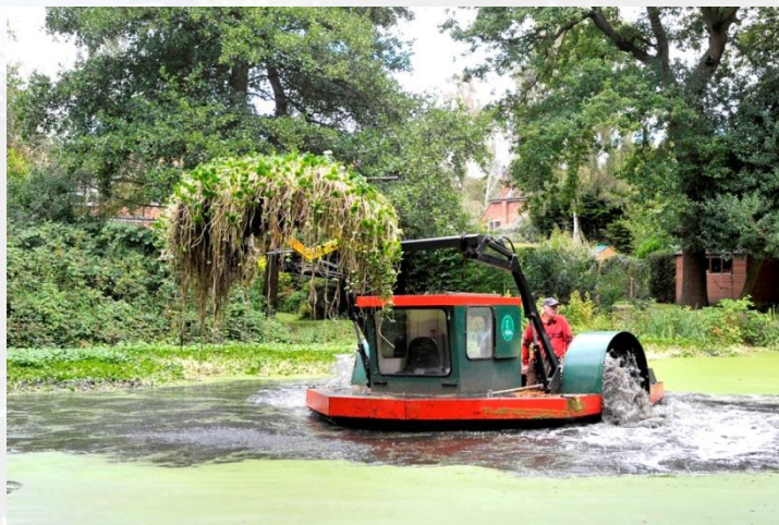
Weedcutter clearing Floating Pennywort

During winter there are two main jobs for the Rangers. First is the major cutting back of overhanging vegetation to avoid the formation of a dense canopy, which can kill understory plants and clog the canal with leaves. It also helps to keep the towpath open and accessible for everyone who wants to use it. All clearance work must be completed before the spring nesting season.