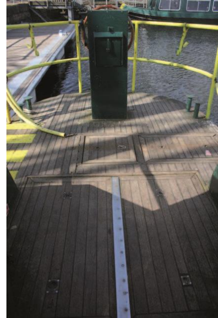
Stern deck, with steering wheel at the helm

An opportunity has recently arisen to purchase a small trip boat from the Chichester Ship Canal Trust and the Committee has therefore decided to take advantage of the offer to acquire this boat which was previously named Egremont . The JP company is fully committed to support the John Pinkerton from its base at Colt Hill and we have therefore recognised that, if Egremont is to be operated in the Woking area, it will need a dedicated team to crew and maintain it. At the present time that team does not exist although we are already receiving offers of support.