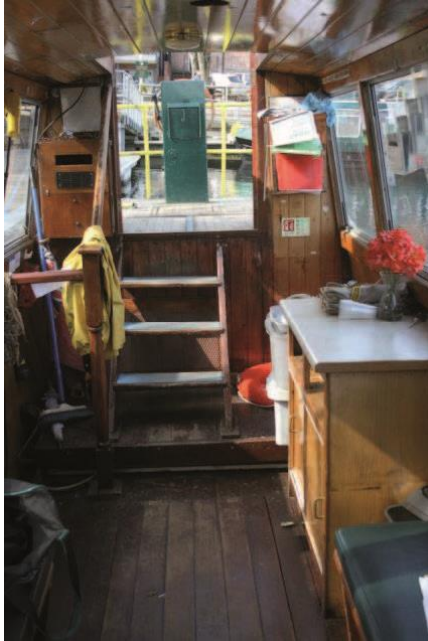
Interior, stern facing

An opportunity has recently arisen to purchase a small trip boat from the Chichester Ship Canal Trust and the Committee has therefore decided to take advantage of the offer to acquire this boat which was previously named Egremont . The JP company is fully committed to support the John Pinkerton from its base at Colt Hill and we have therefore recognised that, if Egremont is to be operated in the Woking area, it will need a dedicated team to crew and maintain it. At the present time that team does not exist although we are already receiving offers of support.