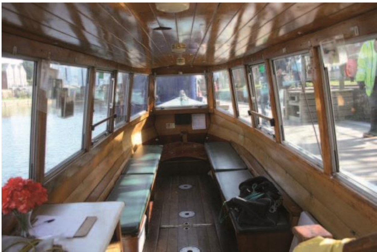
Egremont Interior, bow facing

For some time now, the Society's committee has been considering the purchase of a small trip boat primarily for use at the eastern end of the Canal. The huge success of the John Pinkerton operation at Odiham has meant that our flagship is rarely available for use elsewhere on the Canal. In particular the JP is not normally able to visit the Surrey section below Deepcut. We have therefore been considering whether it would be feasible to run a small trip boat operation at the eastern end. A trip boat operating in the Woking area would enable us to promote the Canal more effectively, both to the general public and to the local authorities who are an important source of financial support for the Canal. (cont...)